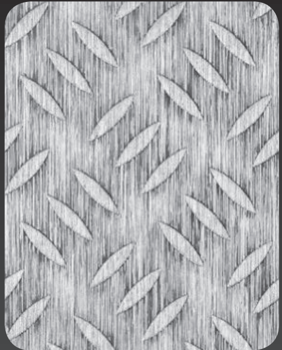
SE-TB1 604 (R12)