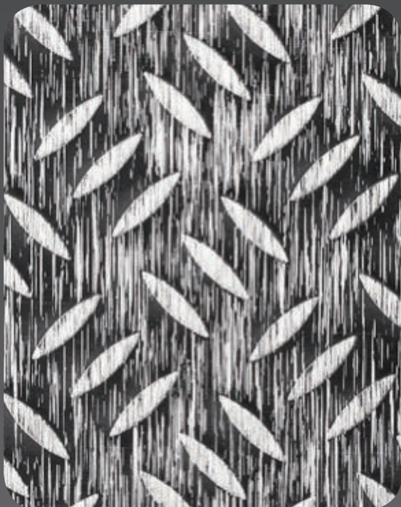
SE-TB1 636 (R13)